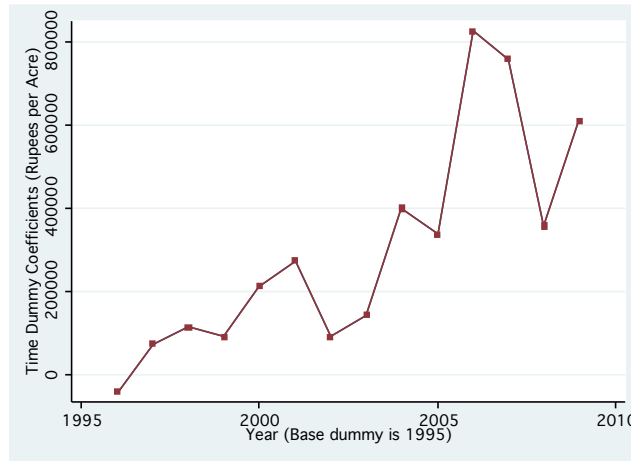
Figure 1: Estimated Change in Land Prices since 1995

One could use the regression in Table 7 to predict prices of Sali and Sona land in 2006. But for the reasons explained above, such an estimate would be unreliable. The regression is also based on the assumption that the Sona premium did not vary over time, in contrast to the rise in the premium witnessed between 1995 and 2005. The paucity of data does not permit inclusion of an interaction of the Sona premium with year dummies in the regression.