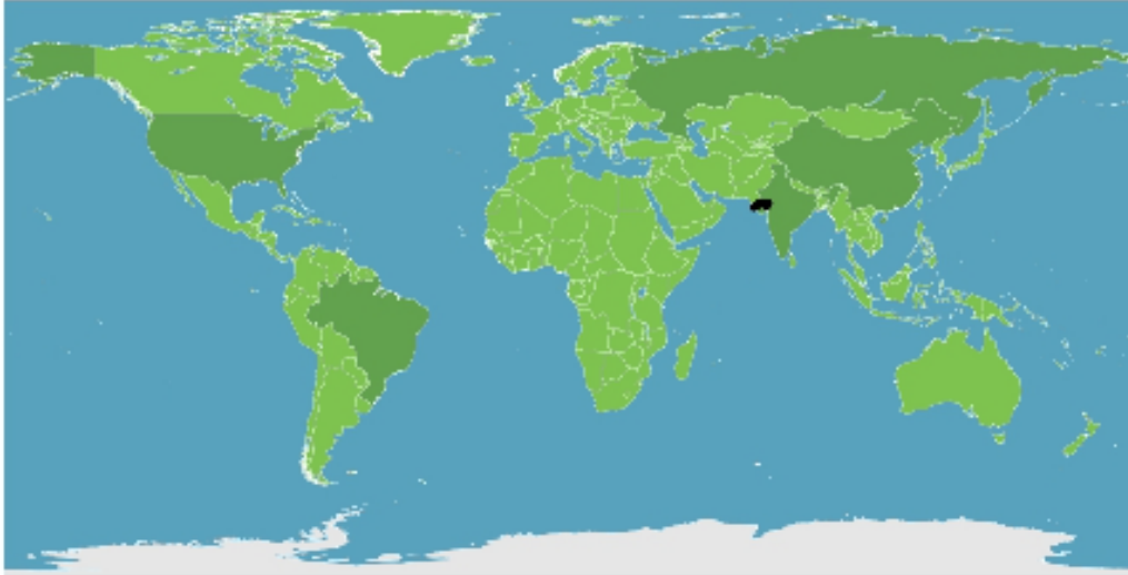
Figure 3 Flat world's economic centre of gravity, 1980–2007. Karachi is the nearest large city to either 2007's or 1980's WECG.